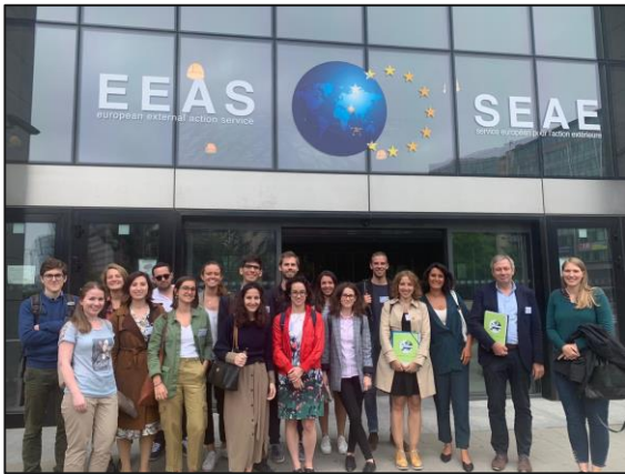
The Seminar Students and the TEPSA Staff at the end of their visit at the EEAS on Day 2